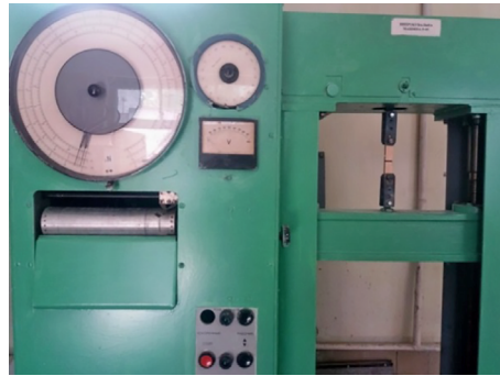
Figure 3. Breaking machine R-05

ing machine of the R-05 brand (Fig. 3). The results obtained after the long-term tests were recorded in the observation log. After that, statistical processing was performed on the basis of which graphical dependencies were constructed.