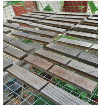
Figure 2. Stand for testing experimental samples in atmospheric conditions

was prepared, samples were made, a stand was installed, and the samples were fixed on it (Fig. 2).