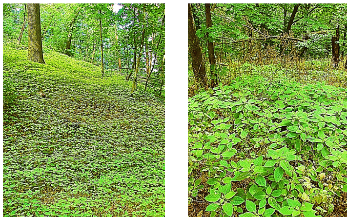
Figure 3. Areas of broad-leaved forests of the Moshnohirsky Ridge dominated by the transformer species Impatiens parviflora in the shrub-grass layer

Dumort., Geum urbanum L., Scrophularia nodosa L. and some other species (Fig. 3).