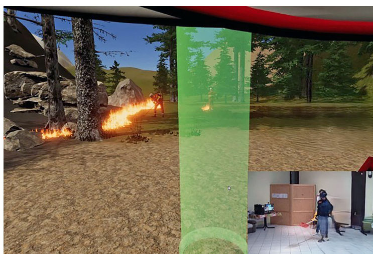
Figure 3. Practicing firefighting measures in the forest using VR technology