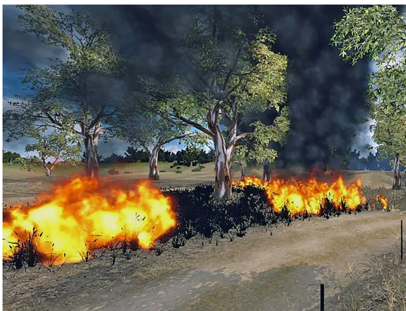
Figure 1. Visualisation of a forest fire using VR technology

the essence of the problem helps to assimilate content through visual representation, identifies the creation of imaginary spaces for unsolved problems, and reproduces real-life situations (Hantson et al. , 2022). As a result of an experiment in the educational environment involving virtual reality technology on forest fire prevention and management, students realised several important truths and dispelled several myths. They clarified that forest fires are caused not only by human negligence. Lightning or summer drought in the forest are situations where humans do not influence the outbreak of a fire, but the fire can instantly break out and spread (Fig. 1-3).