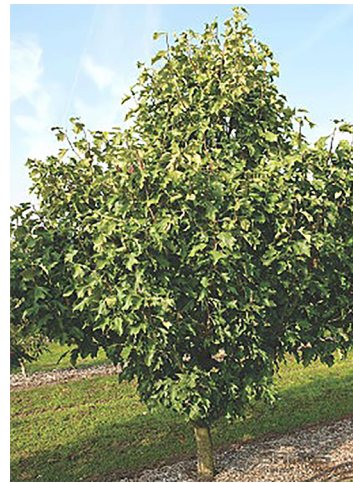
Figure 6. Plant (tree) of the wild form of Slavka checker tree

Signs of identification of the Slavka specimen that determine its difference (morphological, biochemical, etc.): life form – a sprawling tree, crown shape – cup-shaped, a high number of skeletal branches (>10), strong branching, the angle of skeletal branches relative to the trunk is 55° at a height of 1.4 m (Fig. 6).