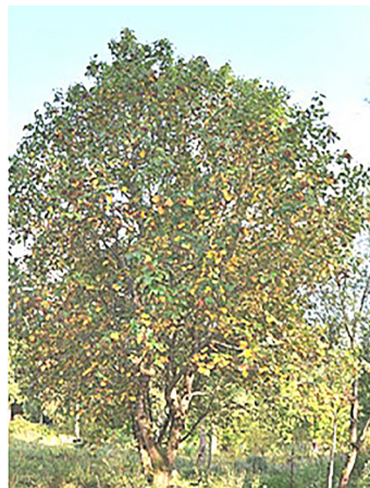
Figure 1. Plant (tree) of the wild form of Eva checker tree

Signs of identification of a sample of checker tree Eva , which determine its difference (morphological, biochemical, etc.) life form – a conical tree with a rounded crown, a high number of skeletal branches (>10) and strong branching. The angle of position of skeletal branches relative to the trunk is 45° at a height of 1.5 m (Fig. 1).