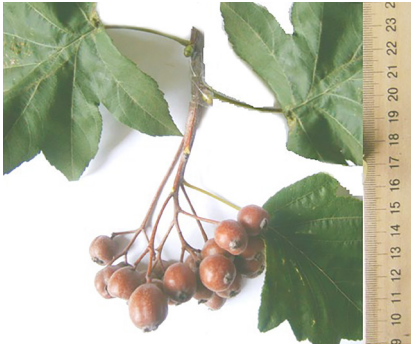
Figure 5. Leaves and fruits of the wild form of Podolianochka checker tree