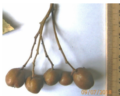
Figure 3. Checker tree fruits of the Eva form

of vegetative buds, budding and flowering, etc. Morphological characteristics of the fruit are as follows: the fruit is tall (2.3 cm), medium in width (2.5 cm), medium weight (2.1 g), colour – light brown, pulp colour – brown, shape – elliptical or broadly oval, peduncle is long (5.5 cm), depth of the calyx – closed, lenticels are located on the skin tightly, the texture of the skin surface is smooth or slightly rustling, the skin pubescence is weak, the colour of the pubescence (villi) is white (Fig. 3).