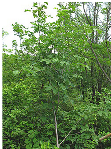
Figure 4. Plant (tree) of the wild form of Podolianochka checker tree

skeletal branches (>10), strong branching, the angle of position of skeletal branches relative to the trunk is 55° at a height of 1.5 m (Fig. 4).