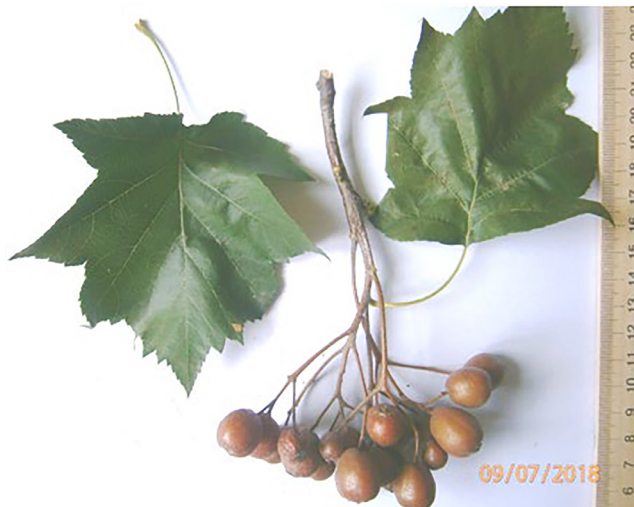
Figure 7. Leaves and fruits of the wild form of Slavka checker tree

um size, with a diameter of 20 cm, the flower is average in diameter (d=1.5 cm), the perianth petals are white, intersect, placed horizontally. The number of flowers on the corymb is greater than for Eva and Podolianochka forms, and averages 58. Self-fertilisation for this specimen is high (more than 75%). Next, the study considers the morphological parameters of fruits: diameter – large (2.4 cm), density of the location of lenticels – average, shape – elliptical, or broadly oval, peduncle length – long (5 cm), skin hairiness – present, villi – whitish, colour – light brown, colour of the fruit pulp – brown, seed colour – light chestnut or brown. The fruit is tall (1.8 cm), average in width (1.5-2.2 cm), and the height-to-width ratio is average (Fig. 7).