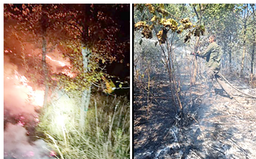
Figure 2. Fire and its consequences in one of the deciduous forest areas

processes. These transformations, characterised by a reduction in species diversity and a simplification of ecosystem structure, ultimately result in a diminished capacity of the forest to withstand adverse external factors.