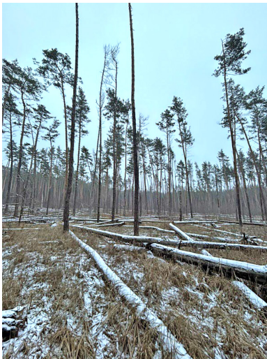
Figure 3. The current state of a pine forest area that in 2008 became a hotbed of grass fire spread and subsequent intensification of the impact of the top bark beetle