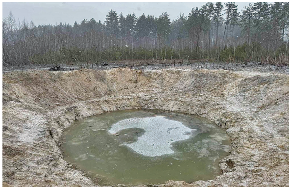
Figure 1. Crater formed by a rocket impact southeast of the village of Buda-Babynetska, Kyiv Region, in 2024

The impact of aerial vehicles, such as planes, helicopters, rockets, and drones, carrying ammunition, explosives, and fuel, has caused significant damage to forest ecosystems. The blast wave, shrapnel, and other fragments have broken tree trunks, branches, and roots, resulting in mechanical damage to plants and triggering forest fires. Powerful explosions have formed craters, leading to tree falls, damage to root systems, and disruption of the soil layer. A similar rocket explosion occurred in February 2024 in a forested area near the village of Buda-Babynetska, Kyiv Region. Figure 1 shows the crater formed by the rocket explosion.