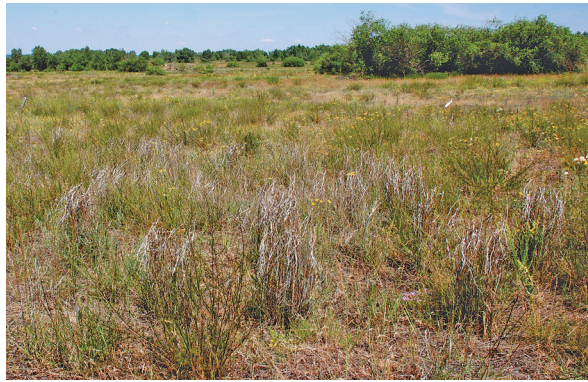
Figure 5. The emergence of the adventive plant sand dropseed ( Sporobolus cryptandrus (Torr.) A. Gray) on sands in the Trokhizbenskyi Steppe branch of the Luhansk Nature Reserve in 2014

research in the Trokhizbenskyi Steppe branch of the Luhansk Nature Reserve of the National Academy of Sciences of Ukraine, which was affected by combat actions and the movement of military equipment from the Rostov Region of Russia (Fedenko, 2023), the appearance of a new species of adventive plant, Sporobolus cryptandrus (Torr.) A. Gray, a perennial bunchgrass, was recorded for the first time (Fig. 5).