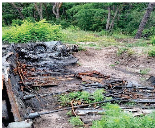
Figure 2. A crater area after shelling in 2022 with damaged military equipment, overgrown with Ambrosia artemisiifolia L. and Robinia pseudoacacia L.

transformed areas. Their research showed that the process of vegetation regrowth in cleared forest areas with destroyed upper tree canopy occurred relatively quickly. However, the regrowth in craters formed by artillery shell explosions was extremely slow, with almost no vegetation observed in the first year after the impact of military actions. Researchers noted the appearance of only a few common ragweed ( Ambrosia artemisiifolia L.) and black locust ( Robinia pseudoacacia L.) plants in one crater at the site of burned military equipment (Fig. 2), while no plants appeared in another crater (Fig. 3).