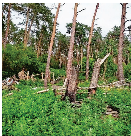
Figure 4. Damage to Scots pine trees ( Pinus sylvestris L.) as a result of shelling in 2022

Hoholivski Hai tract, which may indicate active succession towards false acacia. The territory of the Zalissia National Natural Park (Hoholivski Hai tract), located in the forest area of the Brovary District of the Kyiv Region and the Chernihiv District of the Chernihiv Region, showed ruderalisation of the herbaceous layer (Fig. 4).