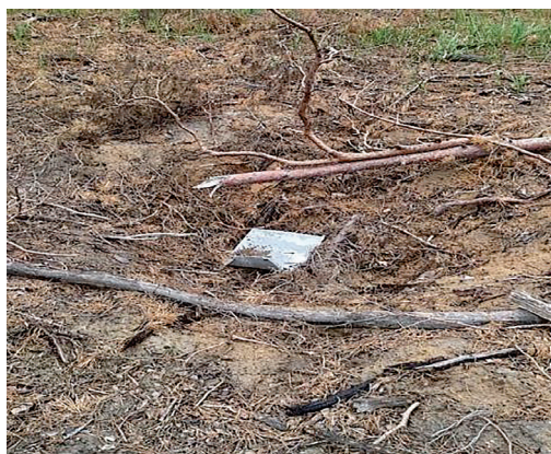
Figure 3. A crater area after shelling in 2022 with completely destroyed herbaceous cover due to fire

Fernald), oleaster ( Elaeagnus angustifolia L.), and black locust ( Robinia pseudoacacia L.), and has caused changes in soil structure, reduced soil fertility, and slowed down natural ecosystem recovery processes. Also, the fire resulted in the displacement of local plant species such as timothy-grass ( Phleum pratense L.), red fescue ( Festuca rubra L.), red clover ( Trifolium pratense L.), and common bentgrass ( Agrostis tenuis Sibth.). The loss of these plants has led to a decrease in biodiversity and disruption of vegetation cover structure, complicating the self-restoration processes of meadow ecosystems. Moreover, the physicochemical properties of the affected soil areas have significantly changed, including increased acidity and decreased humus content, which negatively impact further vegetation succession. In such conditions, the advantage was with adventive species resistant to stress factors, which could alter the ecological balance and cause secondary degradation of biogeocoenoses. Table 2 presents data on the spread of ruderal and adventive species in damaged forest areas and the reduction of forest cover.