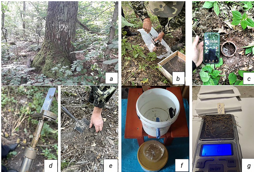
Figure 2. Field and chamber work

Note: a) numbered age-old oak on the trial plot; b) sampling of soil cores using a drill; c) measurement of water absorption time by the soil; d) hardness tester; e) use of a cutting ring to determine the density of the soil composition; f) determination of the volume of conductive roots by the xylometric method; g) measurement of the weight of active roots